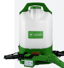
Professional Cordless Electrostatic Backpack Sprayer #65000-01-00

Order sprayers today at foodsafety.ecolab.com