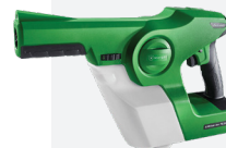
Professional Cordless Electrostatic Handheld Sprayer #65000-00-00